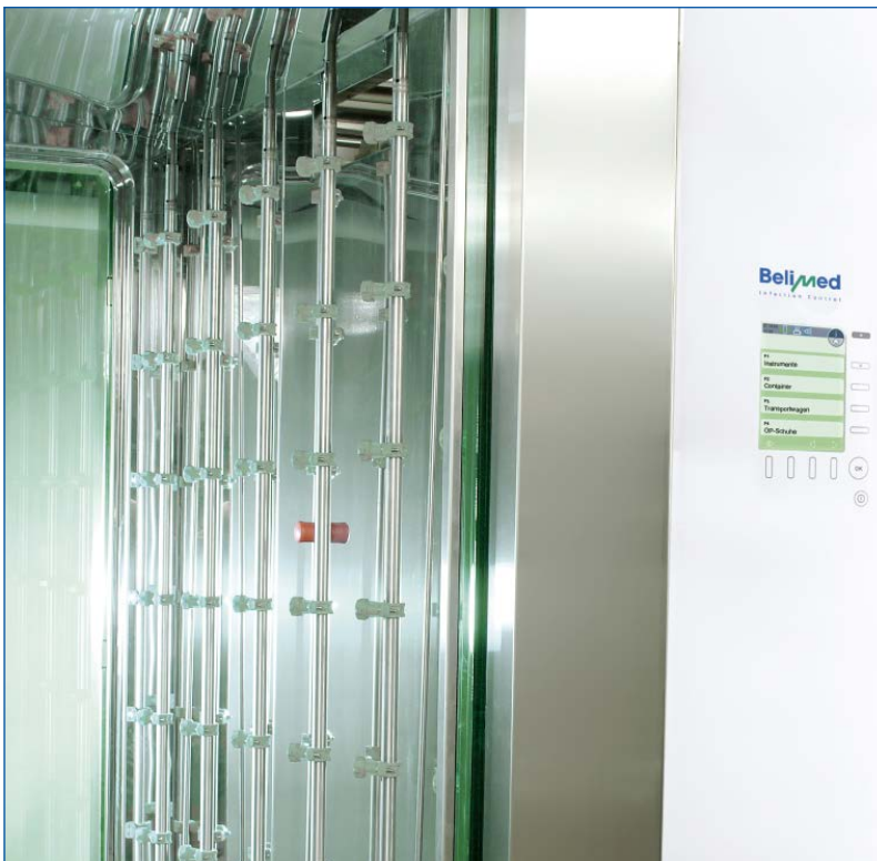
The hygienic chamber design, ensures that cross-contamination carryover between each cycle stage is eliminated.

Moreover, our company's own, regionally organised servicing network offers all services to ensure high system availability, such as inspection and servicing, conversion, spare parts and validation.