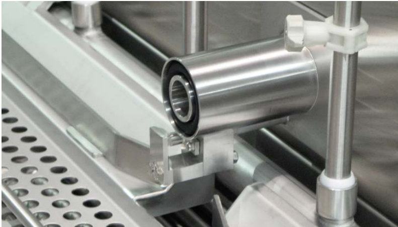
The patented connection coupling with special sealing mechanism ensures constant-pressure, leakage-free supply to the cleaning system and consequently a better cleaning result with higher washing nozzle pressure.

The WD 750 large-scale cleaning system is based on individual customer requirements and consistent implementation of the most recent guidelines and directives.