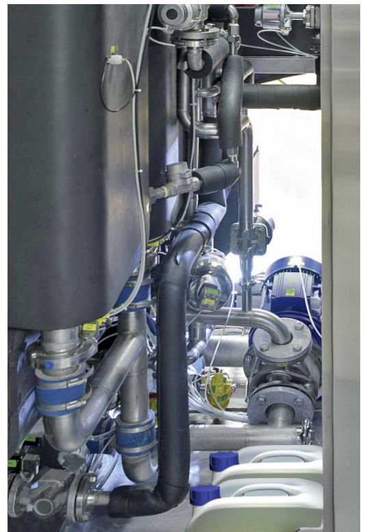
A maintenance-friendly concept: integrated equipment and service compartment with machinery units, utility connections and supply of cleaning containers.