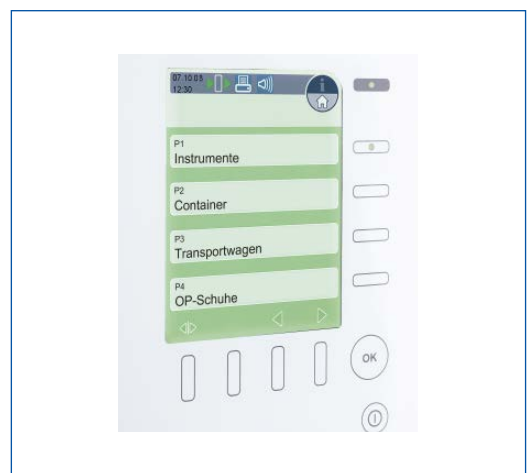
All Belimed systems offer a uniform operating interface, thus reducing training requirements and keeping error sources to a minimum. Clear menu navigation and the illuminated color display of the CP-TOP operating panel ensure even better user comfort.